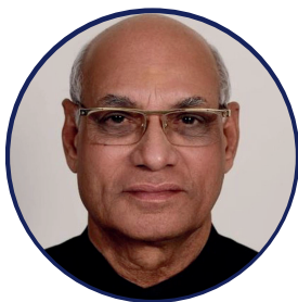
Shri Ramesh Bais

Hon'ble Chancellor HSNC University, Mumbai Governor Of Maharashtra